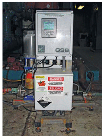
The Werecon computerized pumping system Red Rock installed. This system utilizes a vacuum technology to eliminate the delivery of sulfuric acid at high pressures into the irrigation system.

The second approach Swanson applied was the use of a synthetic acid, settling on applying and spraying applications of Aquatrols Burst Turf wall-to-wall biweekly. Burst is strictly