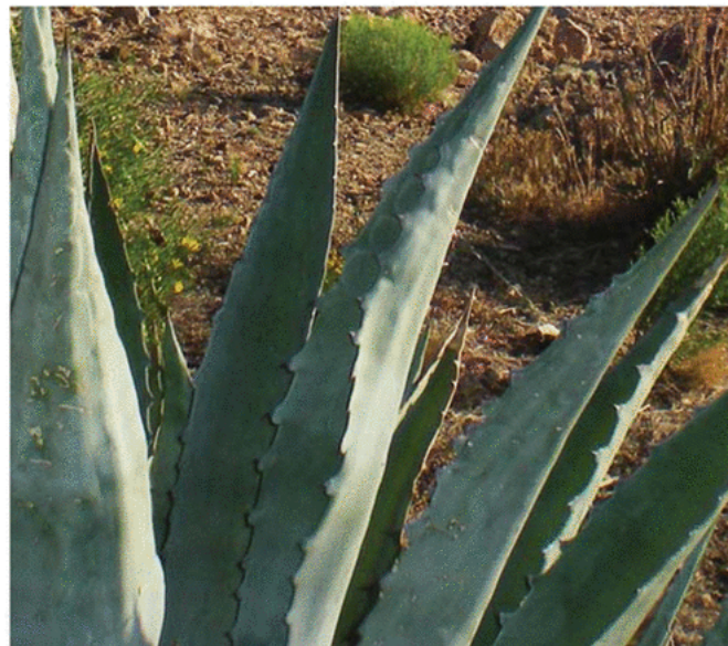
RED ROCK COUNTRY CLUB